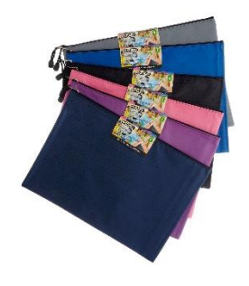
1 Portfolio with Zipper